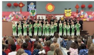
One of the classes sing at the performance in Hurricane, Utah, Feb. 7, 2024

HURRICANE — Three Falls Elementary School recently hosted its annual Chinese New Year assembly, where students from all grade levels put on a show with dancing, singing and even Kung Fu skills.